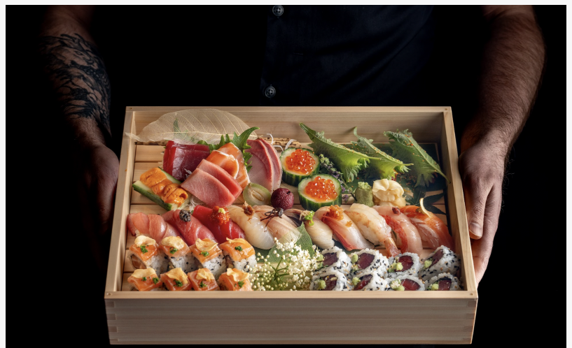
Lucky Cat by Gordon Ramsay in Miami

Fan favorites like the succulent barbecue sea bream and the addictive confit duck leg bao remain, alongside the restaurant's signature sushi, robata grill specialties, and playful bar snacks.