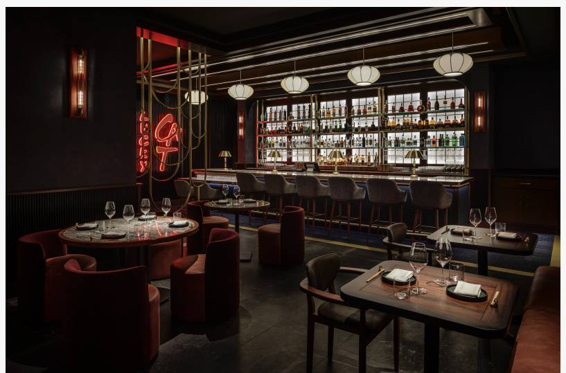
Lucky Cat Miami's Stunning Bar