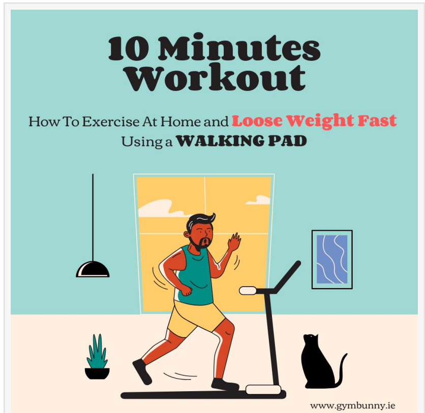
Gym Bunny Walking Pads

□□ Whisper-Quiet Motor – Designed for seamless use while working, watching TV, or taking calls,