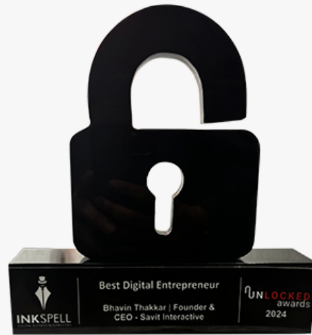
Inkspell Unlock Awards 2024 – Best Digital Entrepreneur

These awards serve as a testament to the expertise and dedication of the Savit Interactive team. The company takes immense pride in these recognitions and sees them as motivation to further push the boundaries of digital marketing excellence.