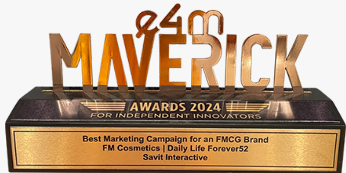
e4m MAVERICK Award 2024 – Best Marketing Campaign for an FMCG Brand