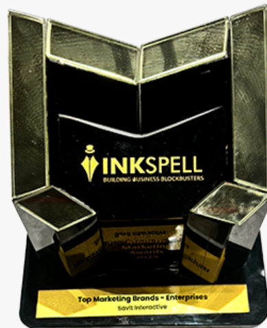
Inkspell Masters of Modern Marketing Awards 2024 – Top Marketing Brands - Enterprises