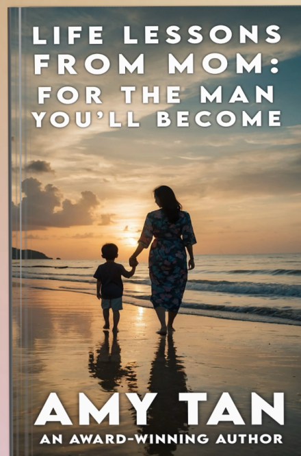
Life Lessons From Mom 2