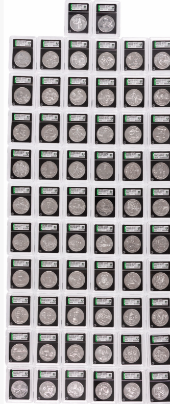
Star Wars: The Power Of The Force (1984) complete base set of 62 pressed aluminum coins, originally made by Kenner for Star Wars mail-away offer. Sold for world-record $42,536

A great favorite with collectors, a boxed Star Wars (1978) Cantina Adventure Set contained bagged action figures of an elusive blue-