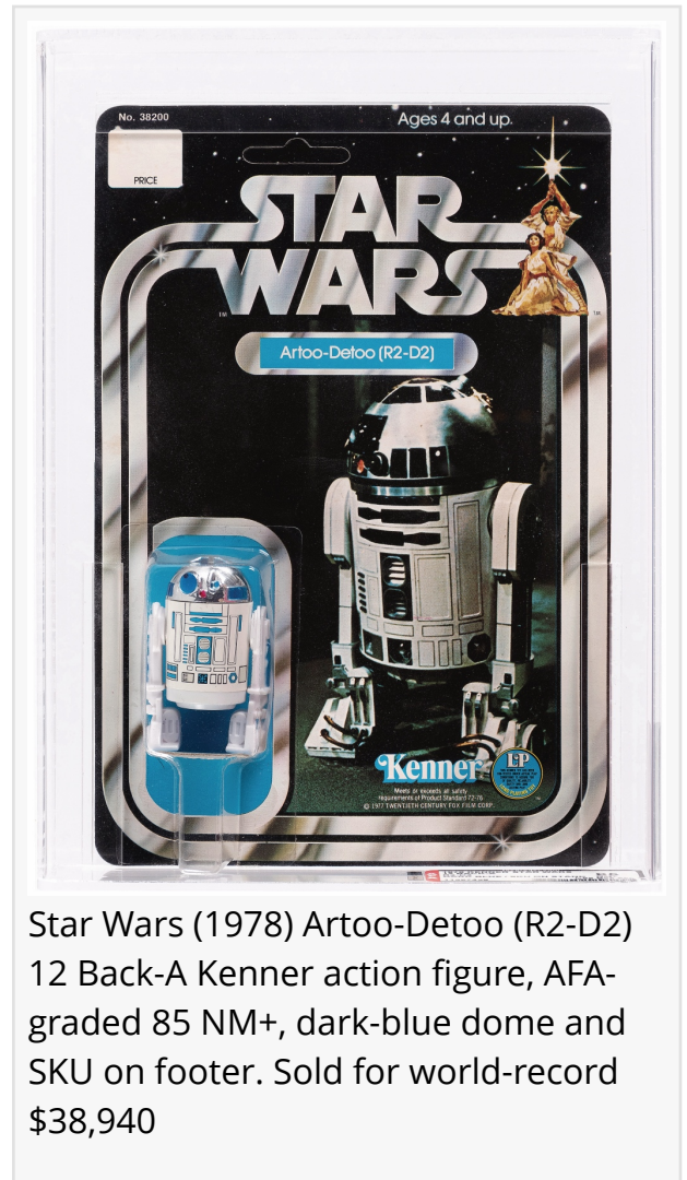
Star Wars (1978) Artoo-Detoo (R2-D2) 12 Back-A Kenner action figure, AFA-graded 85 NM+, dark-blue dome and SKU on footer. Sold for world-record $38,940

proposed 93-Back Power Of The Force cards. AFA-graded 90 NM+/Mint, its obverse design showed two hands holding a lightsaber, while the reverse described the role Jedi Knights played