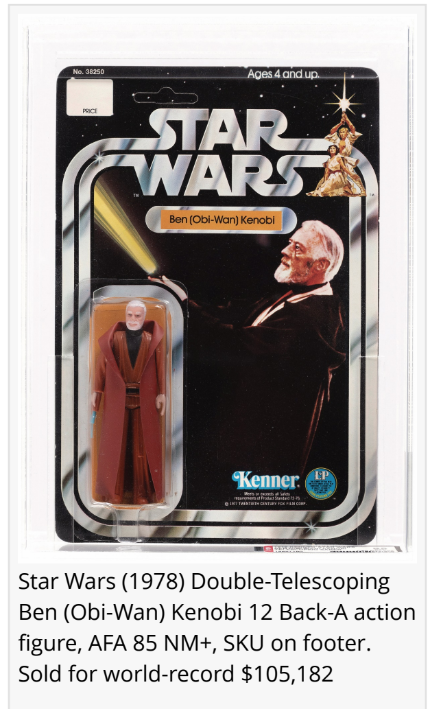
Star Wars (1978) Double-Telescoping Ben (Obi-Wan) Kenobi 12 Back-A action figure, AFA 85 NM+, SKU on footer. Sold for world-record $105,182

Nearly all figures, playsets, vehicles and other items in the collection were AFA-graded and served as a shining testament to Jacob's decades-long mission to upgrade his holdings to the maximum possible level. Most pieces were high grade, and some were the absolute highest-graded specimens of their type, per the AFA Population Report. In the January 22 opening session, 47 pieces were identified as being in the single highest grade known, with none graded