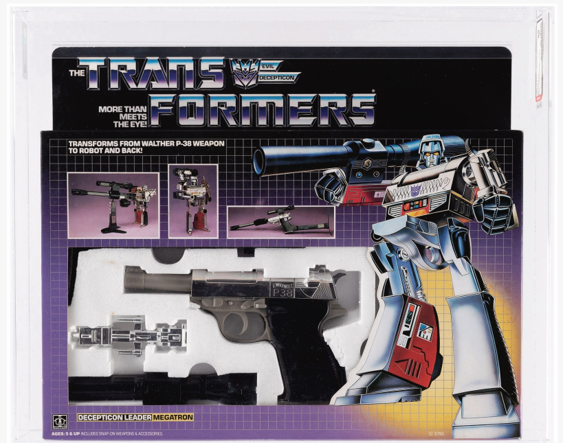
Hasbro Transformers (1984) Series 1 Megatron (Decepticon Leader), AFA 80 NM, sealed box. Sold for $41,301, world-record price for this toy in this grade