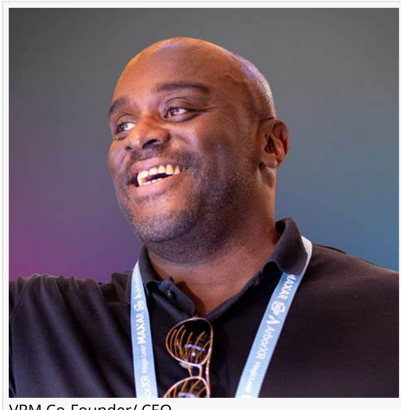
VRM Co-Founder/ CEO

EVOKE has built a strong reputation for providing high-level business networking hubs, hosting premier events, and connecting professionals with influential leaders across various industries. VRM is widely recognized