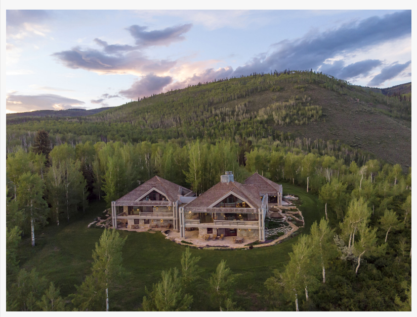
56 Rose Crown, Avon, Beaver Creek/Vail, Colorado 81620