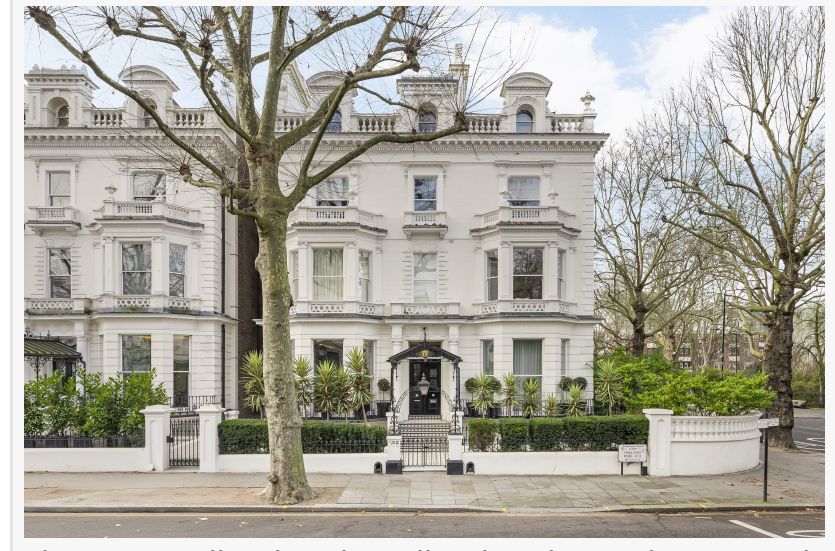
Flat 1, 81 Holland Park, Holland Park, London, United Kingdom