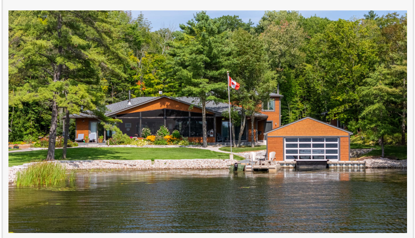
308 O'Hara Point Road, Muskoka District, Georgian Bay, Ontario, Canada