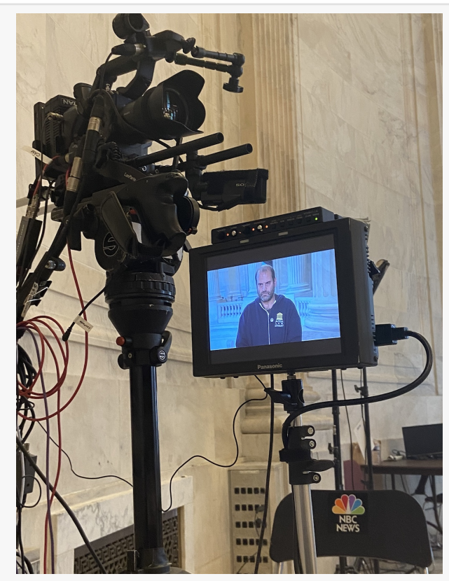
TravelingWiki with NBC News on Capitol Hill to Promote Autism Awareness

The work of TravelingWiki Foundation to document resources for Non Visible Disabilities at US airports, now exceeding 40 airports documented, stems back to the start of TravelingWiki Foundation. TravelingWiki Foundation's non-profit work across the US expands upon prior work in Pennsylvania, including the recent addition of TravelingWiki Foundation's free resources in 12 languages to the Philadelphia Autism Project, in cooperation with Drexel University; and presenting at PNC Park with the Pittsburgh Pirates on June 22, 2024 and August 4, 2024 to promote Autism