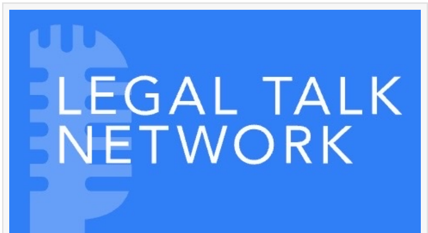
Legal Talk Network