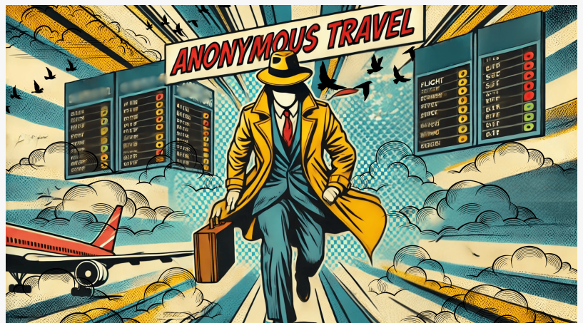
Travel anonymously with Amicus international consulting's help