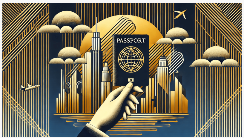
second passport Amicus International Consulting

Amicus aids clients in navigating the complexities of obtaining Tax Identification Numbers (TINs), which are crucial for legal financial operations in foreign jurisdictions. This service mainly benefits individuals and corporations looking to enhance their financial strategies through offshore banking. Amicus ensures that all processes adhere to international tax compliance standards, providing guidance on documentation and application procedures and liaising with tax authorities to secure TINs efficiently.