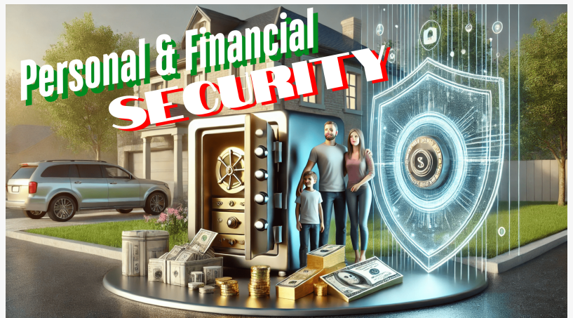
Enjoy personal and financial security with Amicus International Consulting