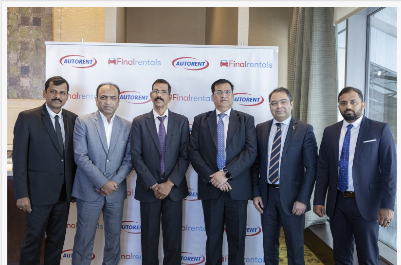
Autorent Car Rental LLC and Finalrentals executives

The partnership is set to enhance accessibility, efficiency, and convenience, addressing key challenges faced by car renters, including transparent pricing, hassle-free bookings, and improved customer support. Through this collaboration, Autorent's large fleet of vehicles will become available via Finalrentals' platform, offering both tourists and residents an optimised rental experience.