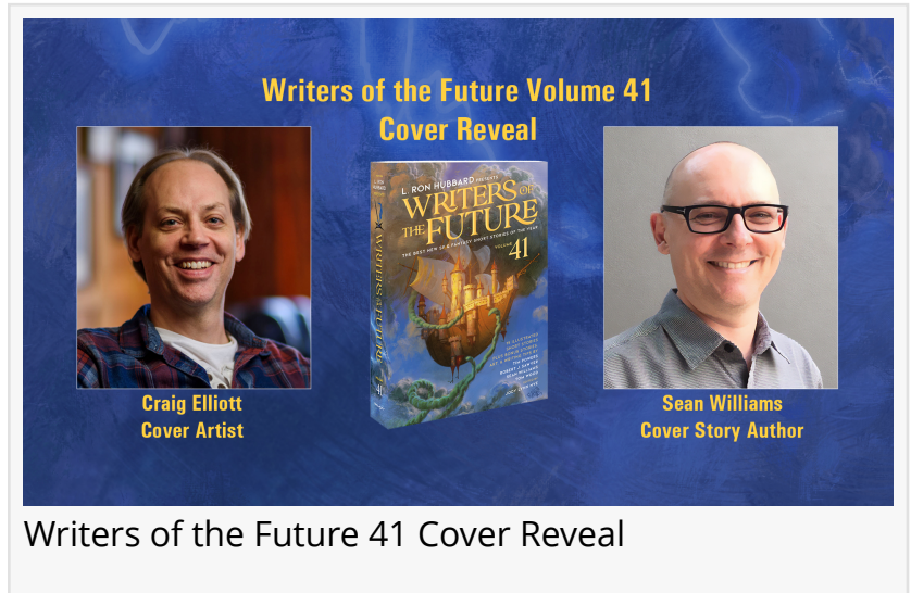
Writers of the Future 41 Cover Reveal

cover artist was on hand to release the cover art, "Creature of the Storm," along with bestselling author Sean Williams, who wrote the cover story based on the illustration, "Under False Colors." The book immediately hit #1 on six bestseller lists. See the release video here .