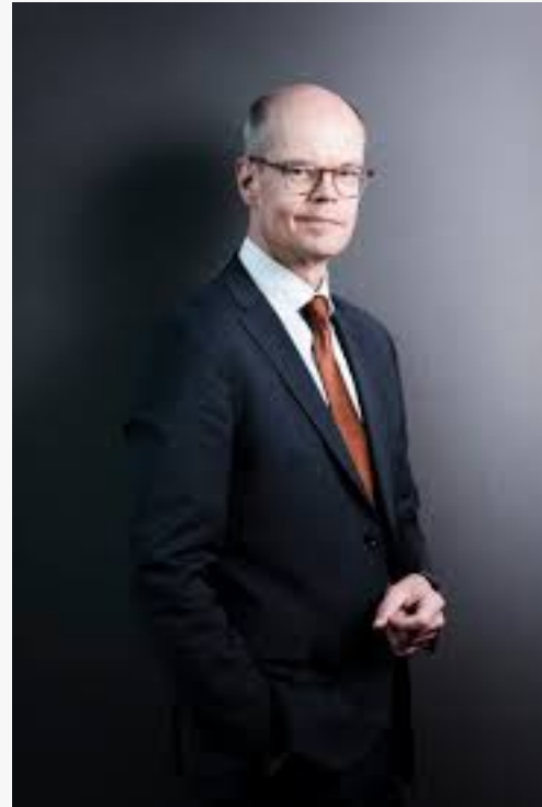
Olli-Pekka Heinonen - Director General, International Baccalaureate Organization

The Global Youth Action Fund is part of the IB's commitment to elevate, empower and support youth voices and is a pathway to action for the Festival of Hope. Designed to unite the global