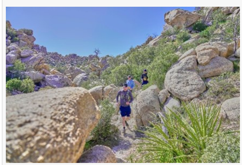
The natural landscape surrounding Pioneertown presents a rugged challenge to runners.