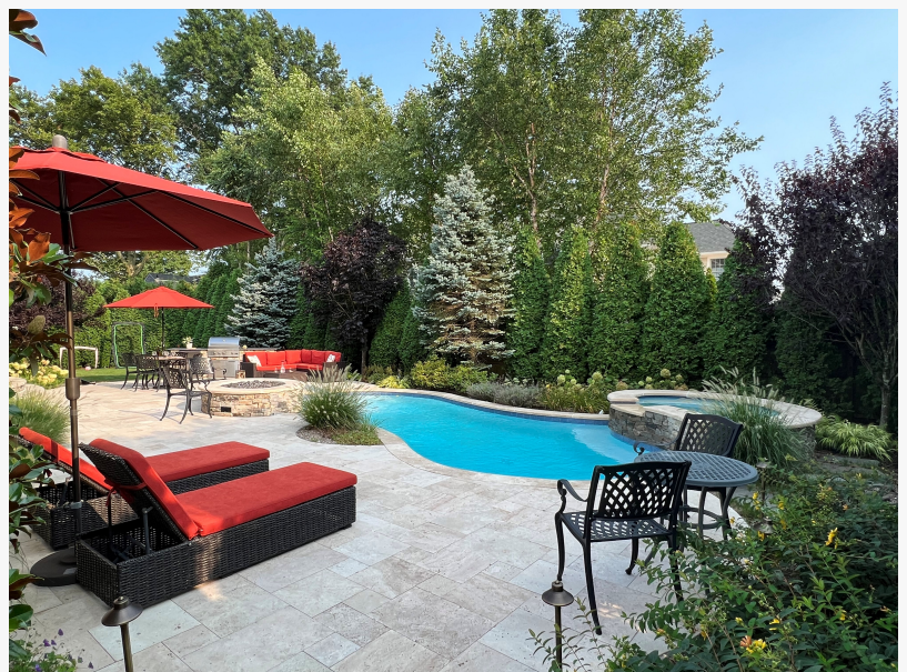
LINLA 2024-2025 Gold Winner - Hicks Landscapes, Illuminated Spaces