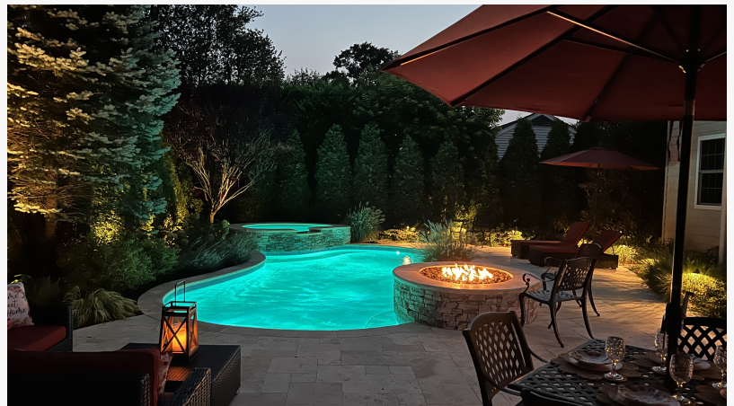
LINLA 2024-2025 Gold Winner - Hicks Landscapes, Illuminated Spaces

Gold Winner: ' Illuminated Spaces : Color, Sound & Light in Balance'. The team at Hicks Landscapes turned this small, waterlogged back yard into multifunctional living space complete with drainage, sod, pool and spa with integrated waterfall fire pit, pavers, outdoor kitchen, seasonal plantings, and lighting for evening entertaining. Thoughtful planning maximized the space, creating an oasis with enhanced safety and sensory experiences for a family member with impaired vision.