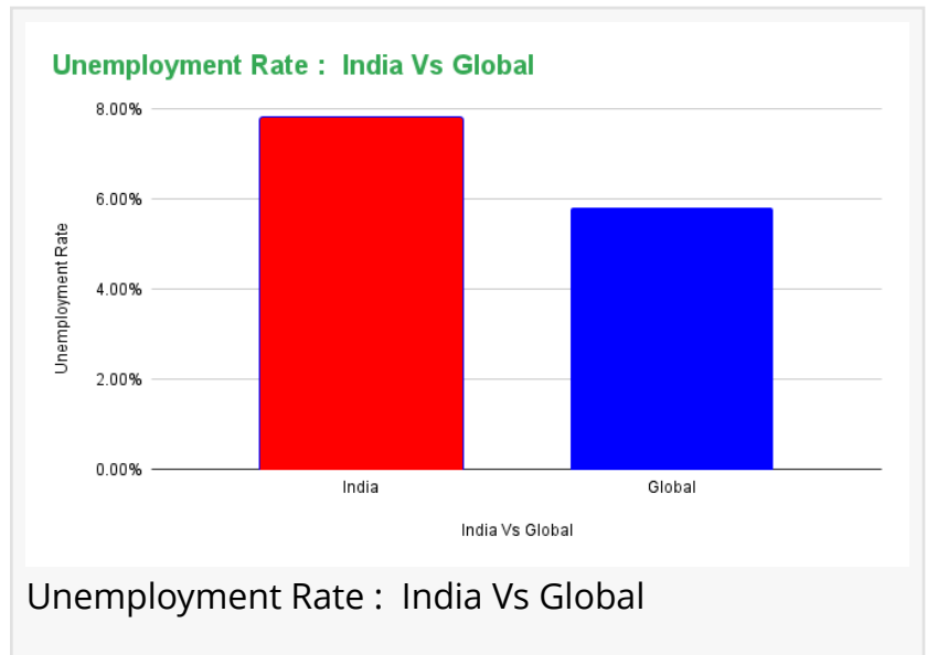
Unemployment Rate : India Vs Global

Job Creation: The budget allocates significant resources to formalizing the gig economy and expanding opportunities in both traditional and emerging sectors. Investments in key industries like manufacturing, infrastructure, and digital services are expected to create millions of new