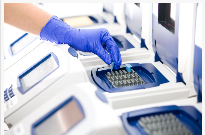
A thermal cycler (PCR machine) enabling accurate DNA amplification through controlled temperature cycles.

ISO 13485 is the internationally recognized standard for quality management systems specific to the medical device industry. It focuses on risk management, product traceability, and stringent regulatory compliance throughout the design, development, production, and delivery of a product.