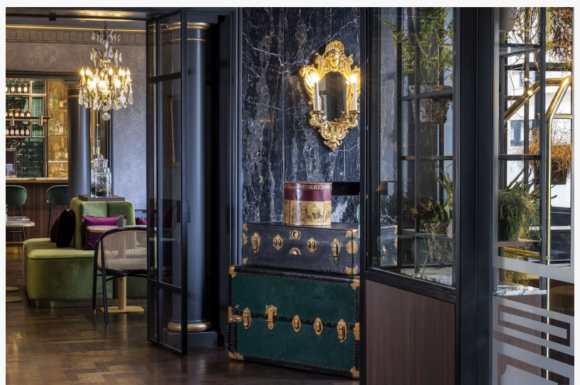
Victoria Palace Hôtel

SANTA MONICA, CA, UNITED STATES, February 4, 2025 /EINPresswire.com/ -- The historic Victoria Palace Hôtel , located in Paris' charming 6th arrondissement, has received its inaugural certification by Green Globe, a globally recognized benchmark for sustainability in the hospitality industry. This significant achievement underscores the hotel's dedication to integrating environmentally friendly practices and embracing innovative sustainability strategies while preserving its rich heritage.