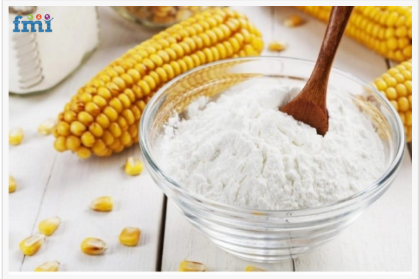
Modified Starch Industry

Modified starch, derived from sources like corn, wheat, and potatoes, plays a vital role in enhancing texture, stability, and performance across various applications. The market is driven by key players, including transnational corporations, investing in innovation and R&D to cater to evolving consumer preferences.