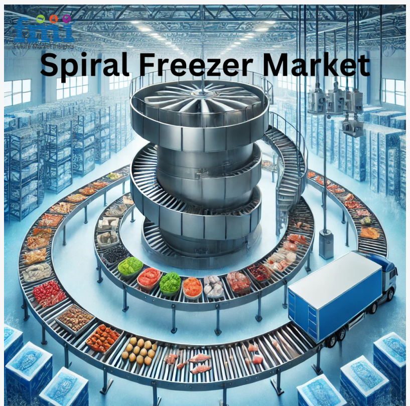
Spiral Freezer Market

□□□□□ □□ □□□□ □□□□ □□□ □□□□□? □□□□□□□□ □□□□ □□□□□□□ □□□□□□□ □□□□□. https://www.futuremarketinsights.com /report- sample#5245502d47422d34323334