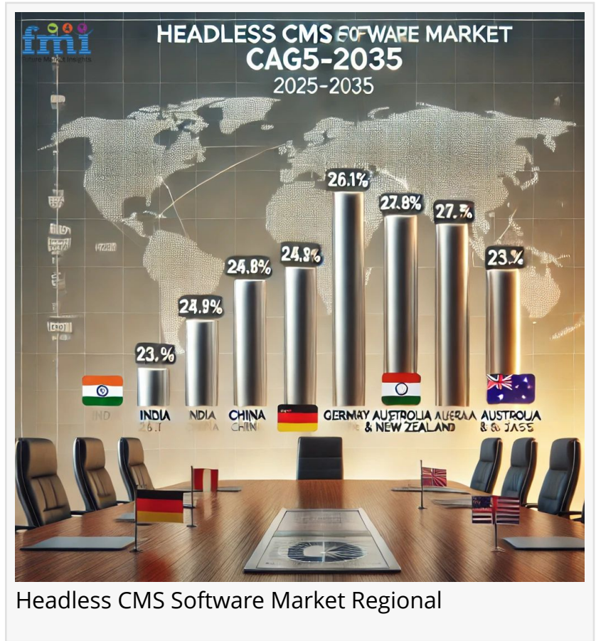
Headless CMS Software Market Regional

Headless CMS software offers a flexible and scalable content management solution. It allows businesses to manage content independently of the presentation layer, enabling a consistent user experience across various devices and channels. This approach is particularly beneficial for businesses looking to streamline their content management processes and improve their digital marketing efforts.