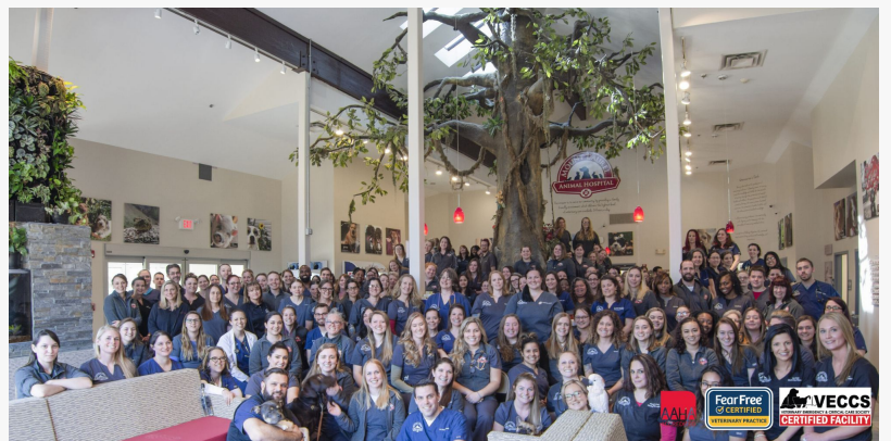
Mount Laurel Animal Hospital Achieves AAHA Accreditation