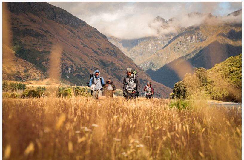
Trekking at The MAGNificent race