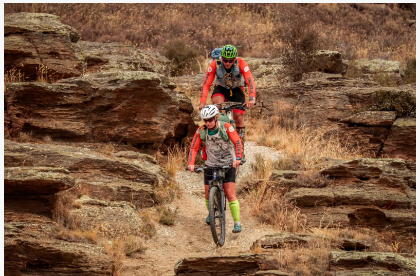
Mountain biking at The MAGNificent