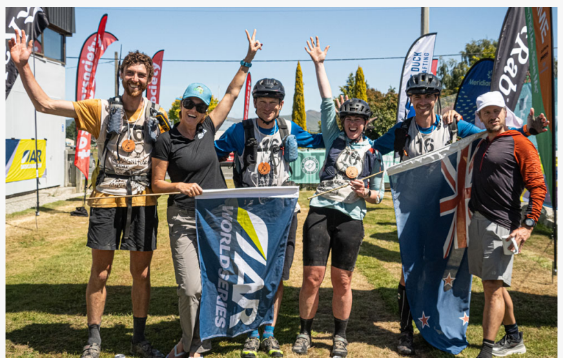
MAGNificent winners Team Sardine Racing of New Zealand

Set in the challenging terrain of the Southland region, the 460km course tested teams over 7 days of non-stop expedition racing and included trekking, mountain biking, pack rafting and navigation. Competitors from 9 nations and a worldwide social media audience called the course design, the scenery, the race media and the performances of the teams