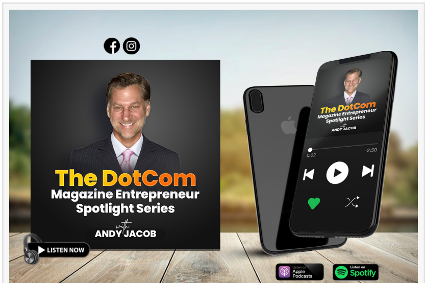
The DotCom Magazine Entrepreneur Spotlight Series-Cover Story