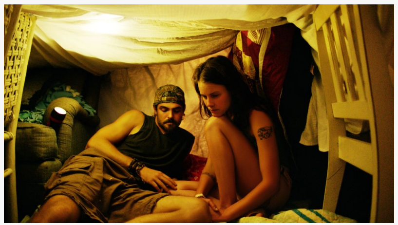
Still from the movie