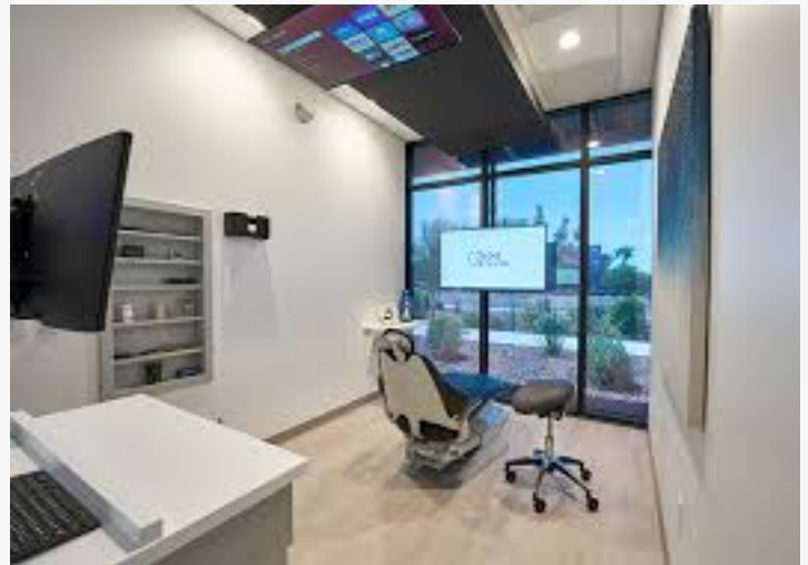
Modern and welcoming dental treatment room at Love Dental, equipped with advanced technology for patient comfort and care in Avondale, Arizona.

For media inquiries, interviews, or further information on Love Dental, please contact: