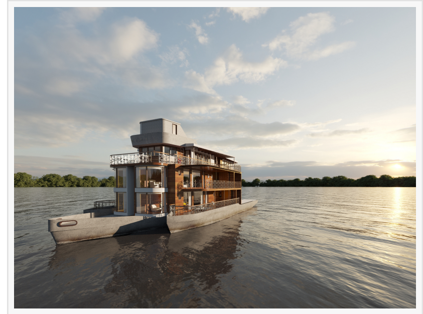
Delfin Amazon Cruises | Delfin I Exterior 2025 Rendering

This press release can be viewed online at: https://www.einpresswire.com/article/782965437