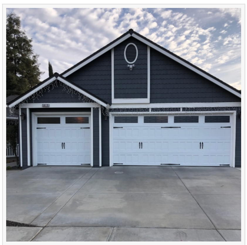
Larry's Garage Door Repair Installed New Garage Door

Larry's Garage Door Repair stands out in the industry for its commitment to quality, affordability, and customer satisfaction. The