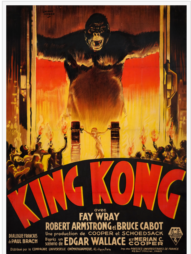
KING KONG (1933) French Grande Poster (Full-Bleed Style A) (LB) est. $20,000 - $40,000

https://www.dropbox.com/scl/fo/qv9iyi3oomv1wmnuhtfi/ALy2I8HNXh-