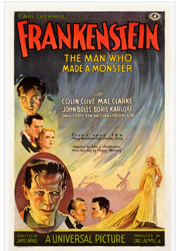
FRANKENSTEIN (1931) One Sheet Poster est. $125,000 - $250,000

Over 900 rare and iconic posters will be available, offering a range of price points to accommodate both seasoned collectors and new enthusiasts. Some of the most accessible lots in the auction include: