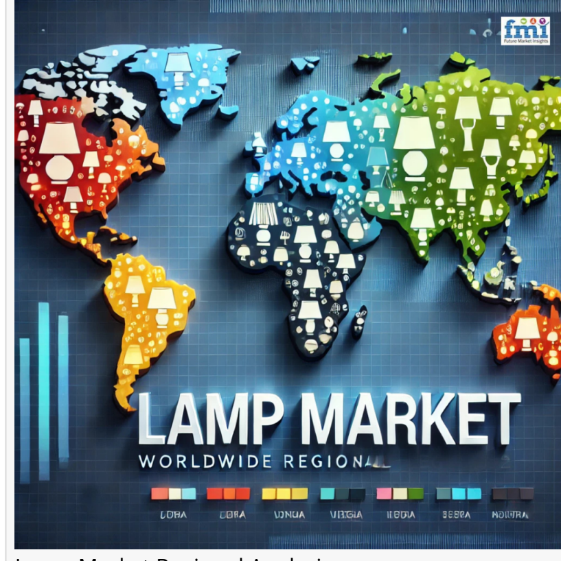
Lamp Market Regional Analysis

as dimmable color temperatures and intensity—are fast gaining popularity with consumers seeking a healthier living environment.