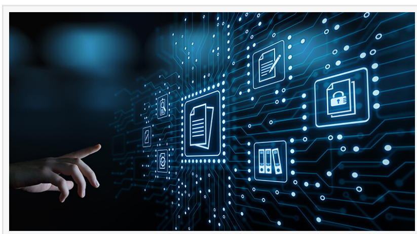
Cloud System Management Market

The global cloud system management market is experiencing substantial growth, driven by the increasing adoption of cloud services and the need for efficient management solutions. In 2024, the market is valued at approximately USD 22.6 billion. Projections indicate that by 2034, the market will reach around USD 118.1 billion, reflecting a compound annual growth rate (CAGR) of approximately 19.16% over the forecast period.