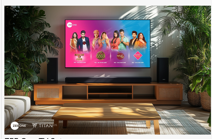
ZEE One TV Set

ZEE ONE UK: Available in the UK, Netherlands, Poland, Denmark, Sweden, Norway, and Finland ZEE ONE GERMAN: Accessible in Germany, Austria, and Switzerland ZEE ONE FRANCE: Broadcast in France, Belgium, and Luxembourg.