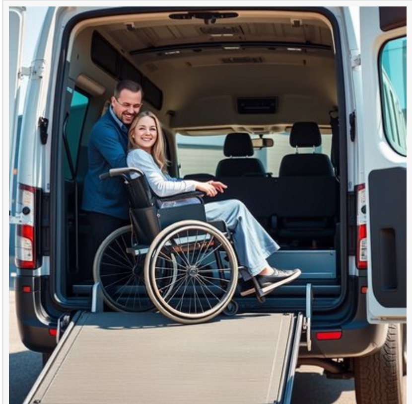
Beyond Ride Wheel Chair

Beyond Ride's initiative goes beyond transportation. This partnership fosters a deeper connection between the community and its assisted living facilities, emphasizing the importance of integrated services in senior care. By providing transportation solutions and promoting these facilities, Beyond Ride is ensuring that seniors can maintain independence, attend appointments, and participate in social activities, thereby improving their