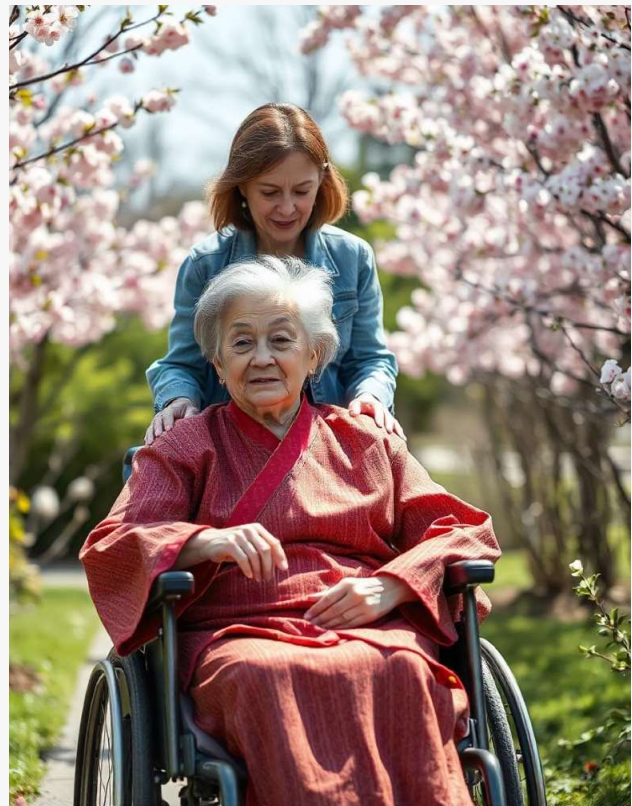
Assisted Living Gig Harbor Caring Assisted Living Facilities

independence, attend appointments, and participate in social activities, thereby improving their