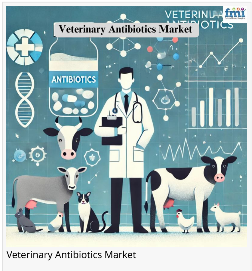
Veterinary Antibiotics Market

NEWARK, DE, UNITED STATES, February 5, 2025 /EINPresswire.com/ -- The global veterinary antibiotics market is set to experience consistent growth, reaching an estimated valuation of USD 20,154.0 million by 2033, expanding at a CAGR of 5.8%. In 2023, the market stood at USD 11,453.3 million, driven by advancements in animal healthcare and increasing awareness of pet well-being. Rising expenditures on veterinary care and growing demand for effective treatment solutions are expected to contribute to the steady expansion of the industry.