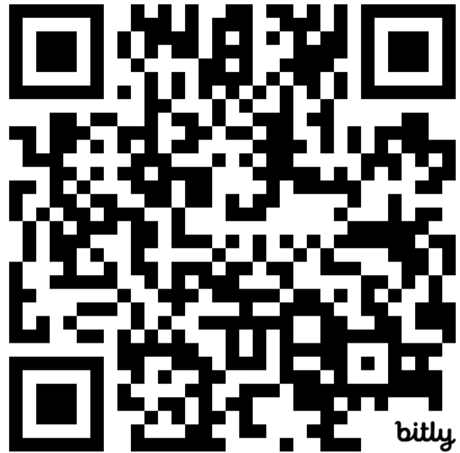
QR Code for Tickets