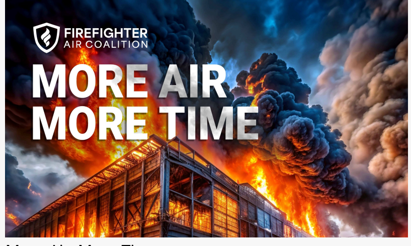
More Air, More Time

hazardous environments. By supplying continuous breathable air, the compressor is an important tool in ensuring the firefighter has a sufficient air supply for More Air, More Time.