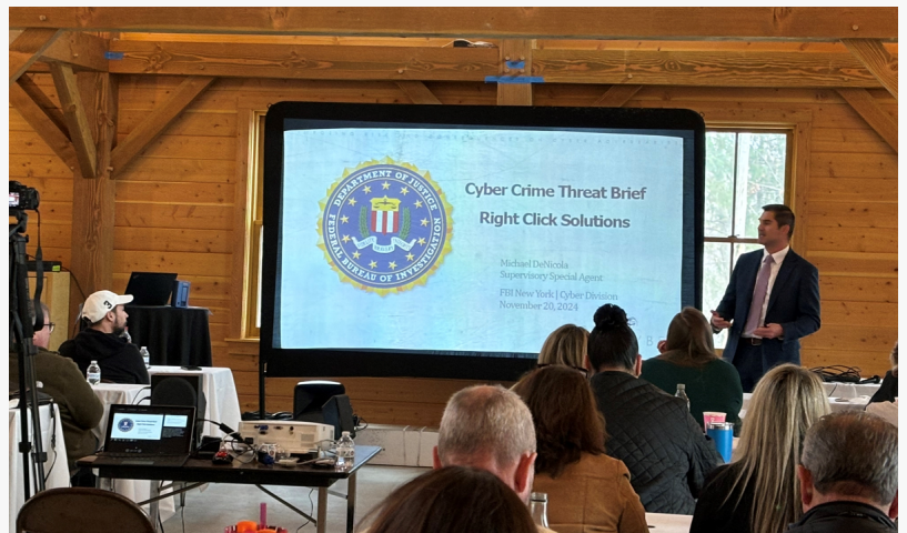
Cybersecurity Conference Attendees