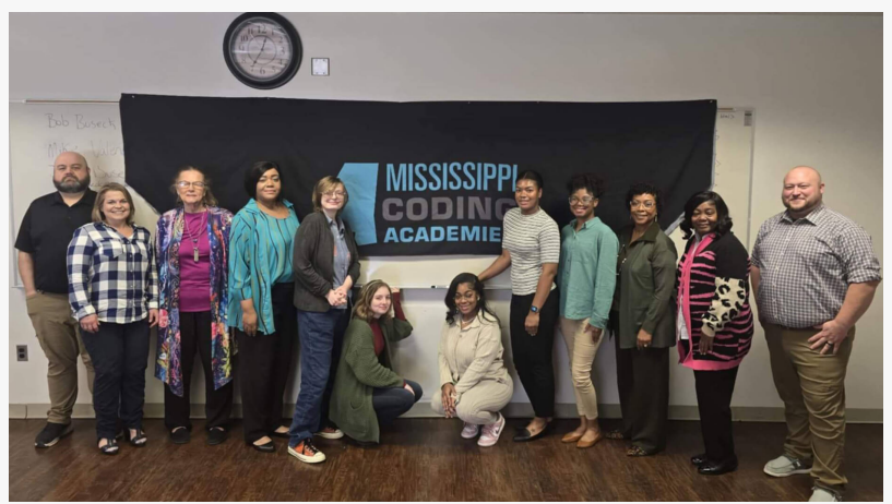
The students and instructors of Cohort I of Mississippi Coding Academies Miss-Lou / Natchez Campus begin the first steps into a new era of tech training for the region.

Natchez Workforce Development is actively recruiting students for the academy's second cohort, which begins the first week of July 2025 and concludes in December 2025. Aspiring coders from Natchez and surrounding areas are encouraged to apply and take a significant step toward a rewarding career in technology.