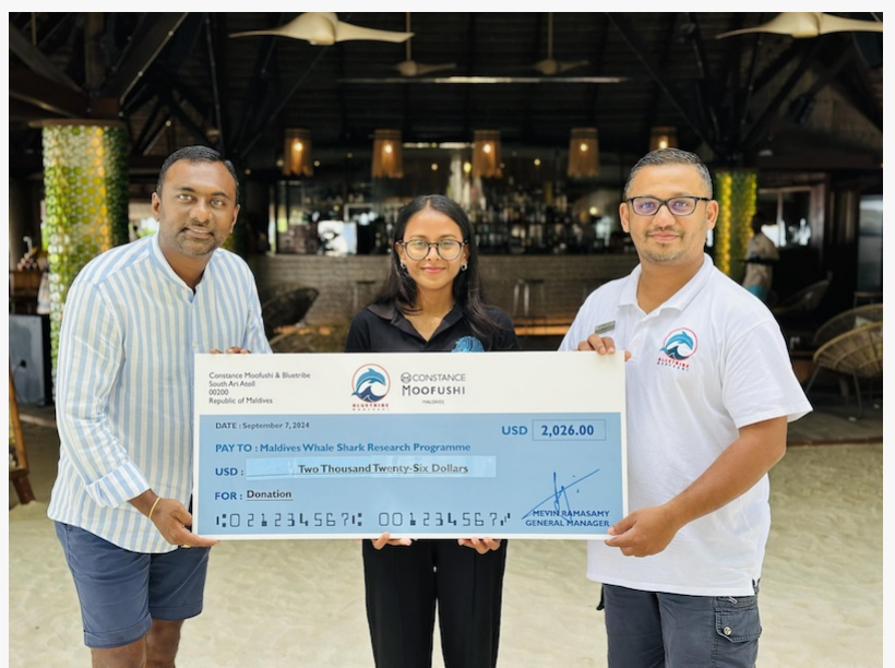
Whale Shark Research Donation Program

Constance Moofushi Maldives is a luxury all-inclusive resort offering guests a tranquil and eco-conscious experience in the beautiful South Ari Atoll. The resort is known for its exceptional service, stunning overwater villas, and pristine beaches. In addition to providing an idyllic getaway, the resort actively supports sustainability through initiatives such as its commitment to reducing energy consumption and promoting sustainable food practices. They also emphasize supporting local communities and preserving the marine ecosystem, ensuring that guests can enjoy the natural wonders of the Maldives responsibly.