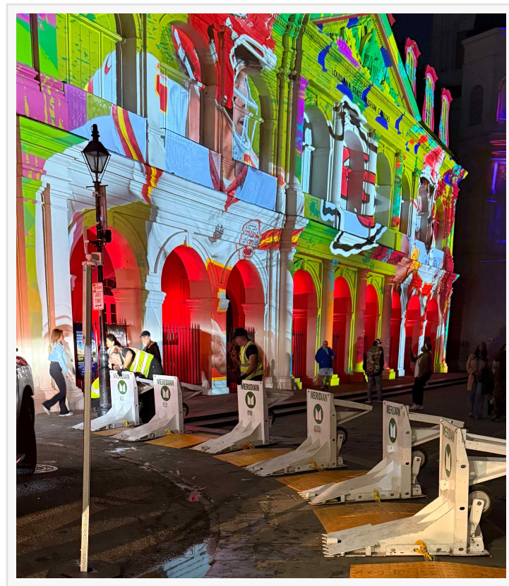
New Orleans Barrier Set Up

More than 270 Archer barriers will be on busy Canal and Rampart Streets. Their appeal is that they can be wheeled in and out in minutes, firstly to establish the pedestrian