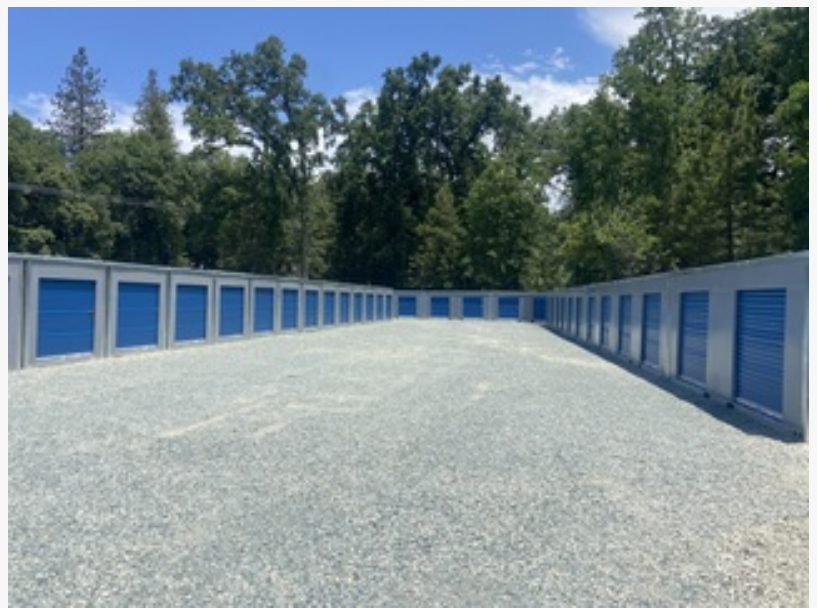
Ranch House Storage in Pine Grove CA Main View

The success of Ranch House Storage was built on meticulous research and hands-on construction. BGL Properties' team, led by co-owners Edwards and Kevin Kraft, plus a group of family and friends, physically assembled every storage unit themselves, even driving their own forklift.