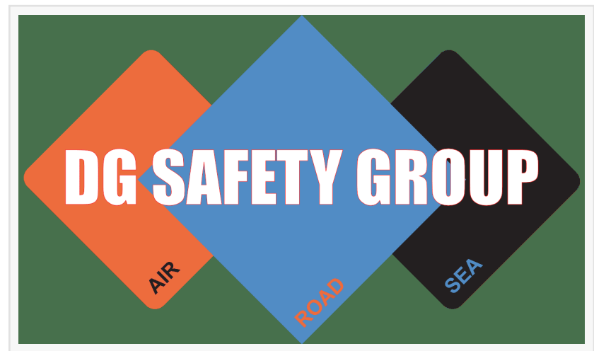
Dangerous Goods Safety Group

Since 31st December 2022, businesses involved in the consignment, transport, packing, or unpacking of dangerous goods must have an appointed Dangerous Goods Safety Advisor (DGSA) to ensure compliance with regulatory requirements. This legal mandate is designed to enhance safety, reduce environmental risks, and uphold best practices in hazardous materials handling. Companies