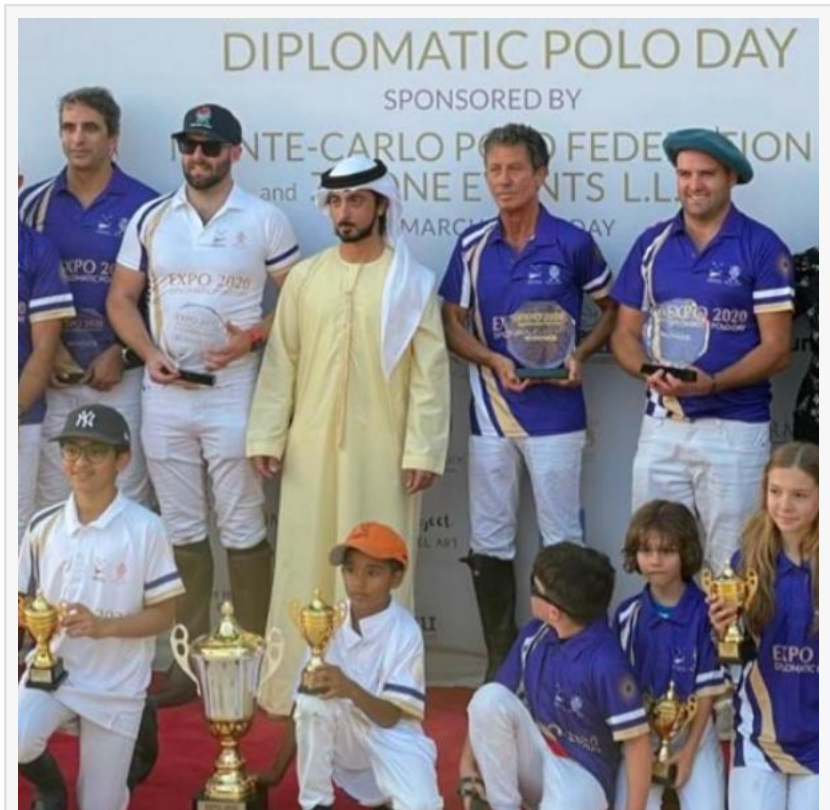
Monte Carlo Polo Diplomatic Cup 2025 Awarding Ceremony

Following the polo matches, guests were treated to a fashion showcase organized by Tomas