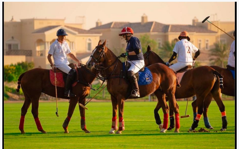
Monte Carlo Polo Diplomatic Cup 2025