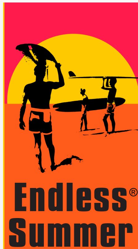
The Original Endless Summer Poster Art