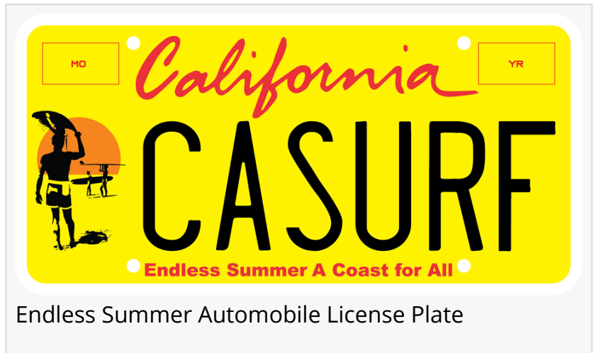
Endless Summer Automobile License Plate