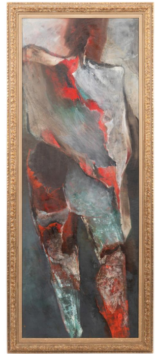
Untitled oil on canvas abstract figural painting by Krishen Khanna (Indian / Pakistani, b. 1925), signed lower left, signed and dated to verso, 71 inches by 26 ¾ inches wide (canvas) (est. $20,000-$30,000).