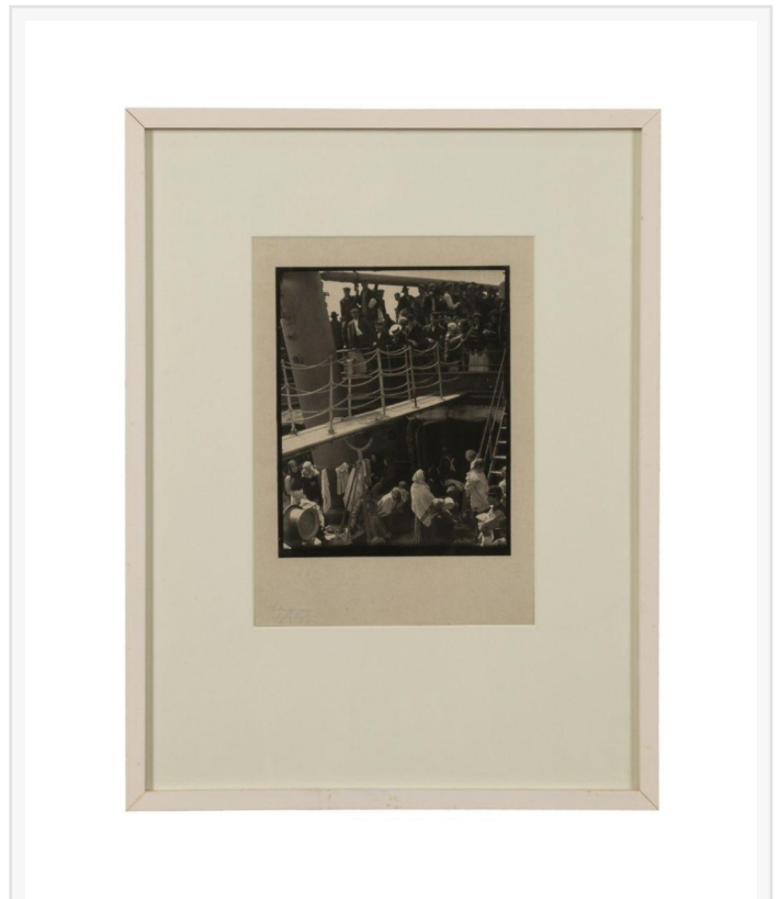
Small format photogravure on Japanese tissue paper mounted on board by Alfred Stieglitz (American, 1864-1946), titled The Steerage, pencil signed, titled and dated lower left (est. $35,000-$50,000).