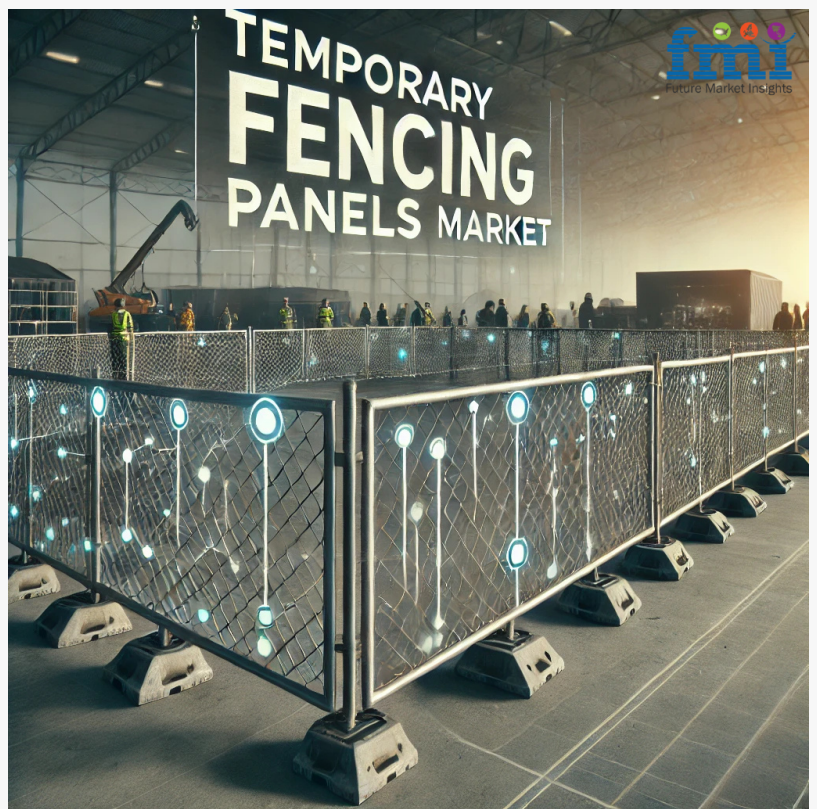
Temporary Fencing Panels Market

NEWARK, DE, UNITED STATES, February 6, 2025 /EINPresswire.com/ -- The global temporary fencing panels market to achieve notable value of USD 3,694.1 Million in 2025, laying the foundation for an exciting trajectory ahead. Projections indicate a substantial surge to USD 5,312.5 Million by 2035, supported by a robust Compound Annual Growth Rate (CAGR) of 3.7% throughout the forecast period, according to insights derived from FMI analysis.