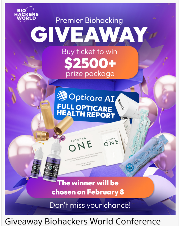
Giveaway Biohackers World Conference Los Angeles 2025

- Networking Opportunities: Connect with likeminded individuals and industry pioneers shaping the future of wellness.