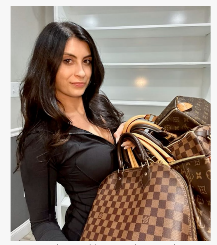
Designer Goods at Goldpawnership on WhatNot Live Auctions