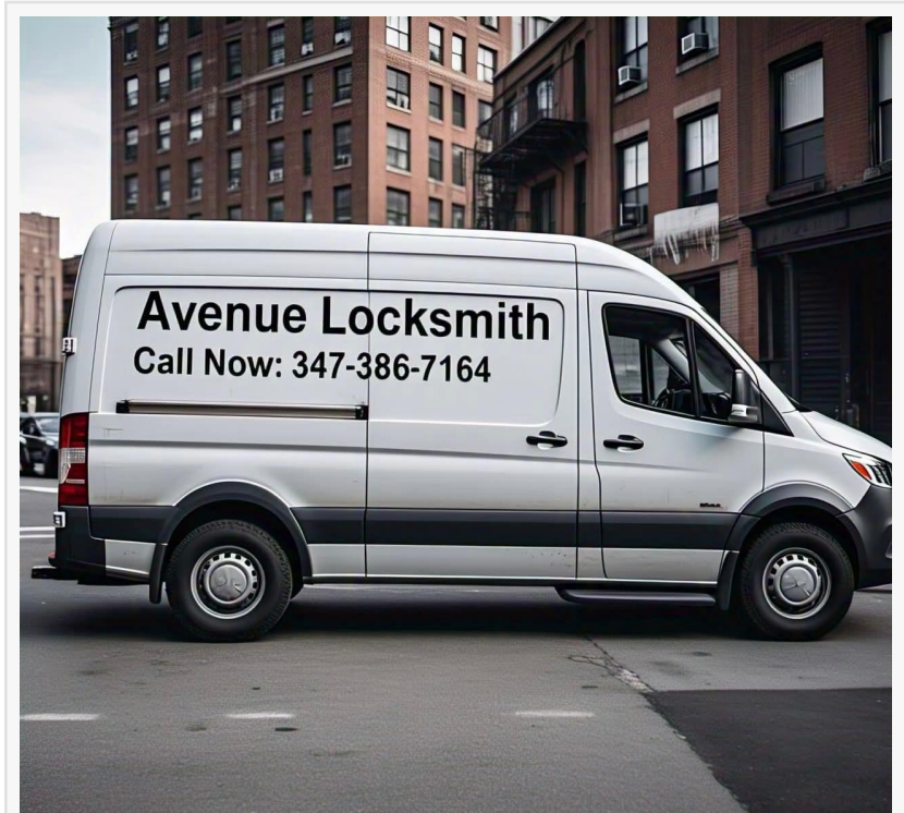
Avenue Locksmith Van, Brooklyn, NY