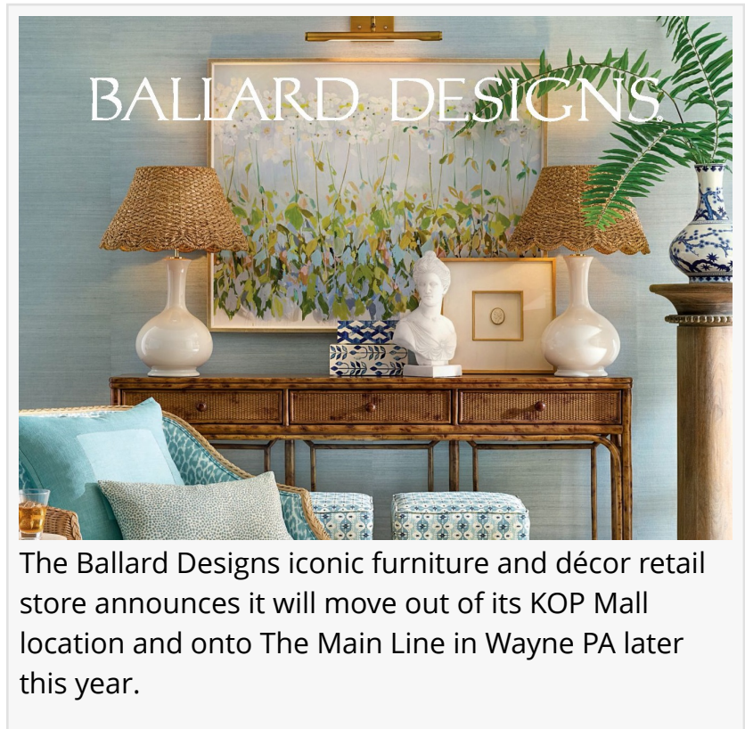
The Ballard Designs iconic furniture and décor retail store announces it will move out of its KOP Mall location and onto The Main Line in Wayne PA later this year.

Wayne is one of Philadelphia's highly affluent suburbs situated along the tracks of the Pennsylvania Railroad and is also among the nation's wealthiest areas. The town's center was designated the Downtown Wayne Historic District in 2012.